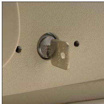
Optional Medeco™ Fail-Safe Key Lock Override