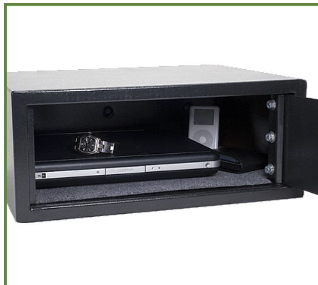
AVAILABLE IN BLACK, BEIGE or CUSTOM COLORS