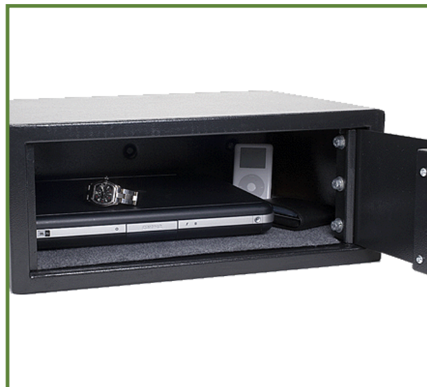
HOLDS 17" LAPTOP & MORE