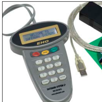
Emergency Handheld Override (EHO)