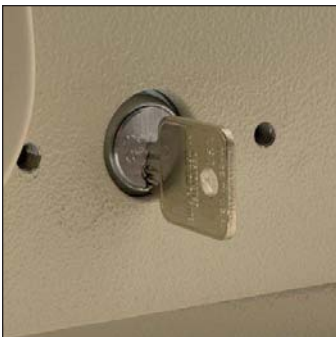
Optional Medeco™ Fail-Safe Key Lock Override